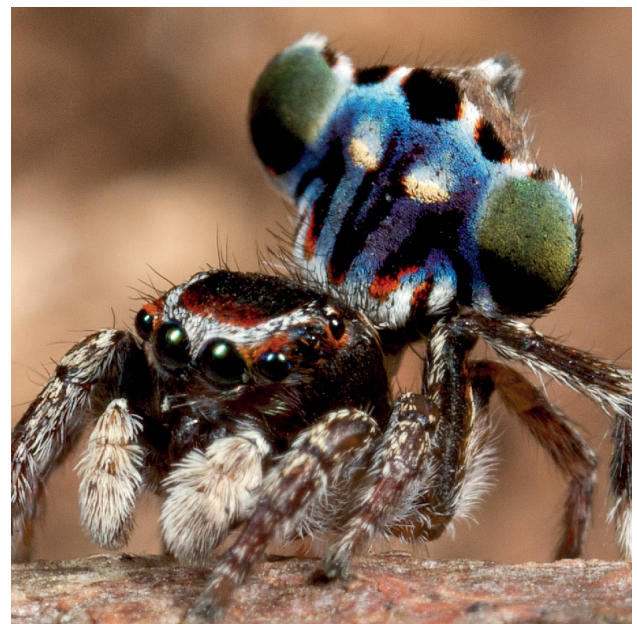
Figure 1: Peacock spider, Maratus harrisi, discovered by citizen scientist Stuart Harris.

Australian citizen scientists have discovered new species (Figure 1), played a role in breakthroughs on debilitating diseases 4 , identified and classified distant galaxies 5 , and contributed to new ecological theories. 6